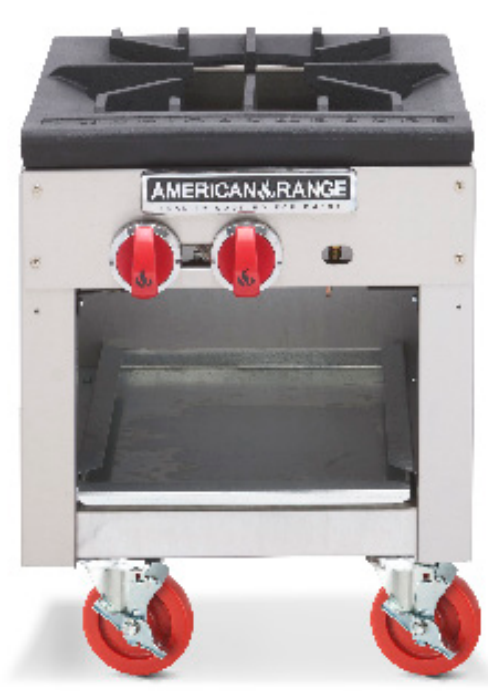
Model Shown ARSP-18 Comes with optional casters.